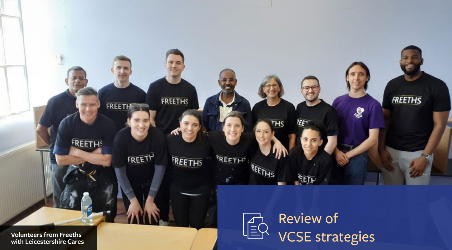
Volunteers from Freeths with Leicestershire Cares